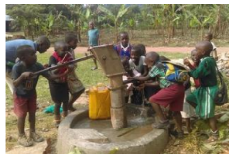
The sheer joy of fresh water!

Future donations will be used to fund increased provision of education for poor communities in a Christian setting.